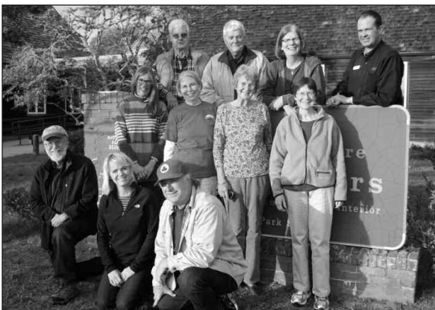
Friends Board of Directors, 2015-2016