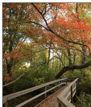
Red Maple Swamp boardwalk before deterioration, and its current condition.

Friends has just committed to a major fundraising campaign to help the Seashore restore sections of the boardwalk of the popular Red Maple Swamp Trail at Fort Hill, which has been closed for several years due to structural concerns and deterioration. The Gala is the kickoff of this ongoing campaign – all proceeds raised will go to restoring the boardwalk.